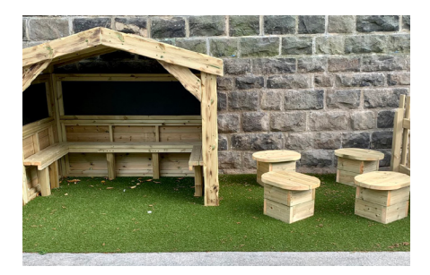
(Above) New Park Primary Academy's wonderful new EYFS outdoor area is complete and ready for the children!