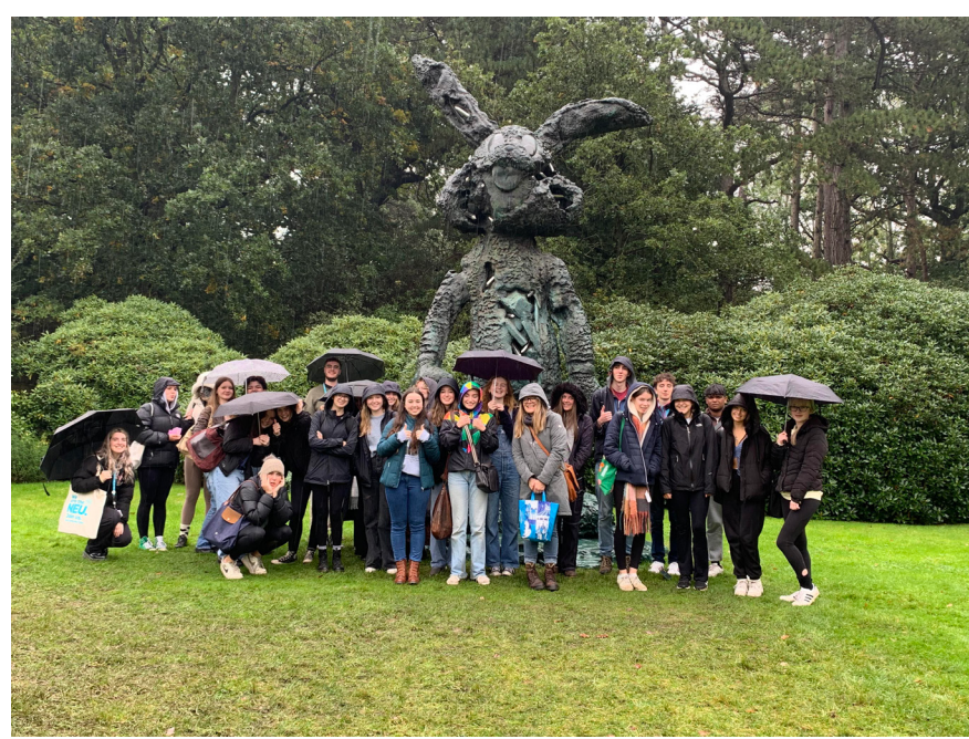
"A very thought provoking experience"