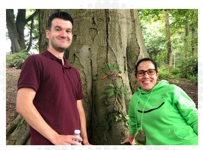
Page 14 // Skipton Girls' High School Newsletter // Issue 100