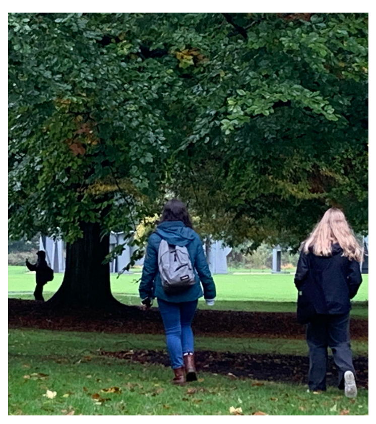
"It was a brilliant day"